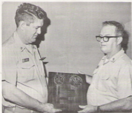
NEW MASTER CHIEF OF THE COMMAND